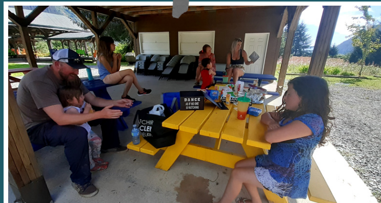
BC SUMMER READING CLUB